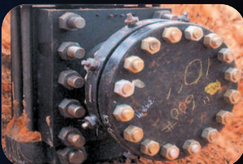
Pipe Repair Services