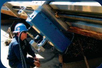
Field Machining Services