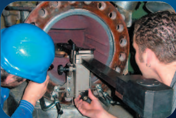
Valve Repair Services

The right people, technology and experience to keep your pipelines and plants online.