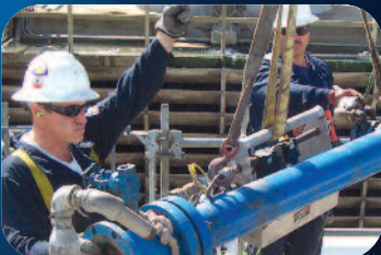
Hot Tap Services