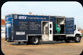
Mobile Heat Treating