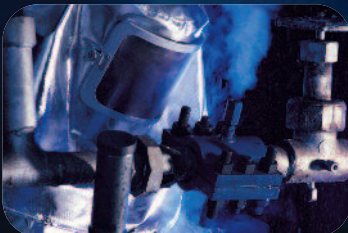
Leak Repair Services