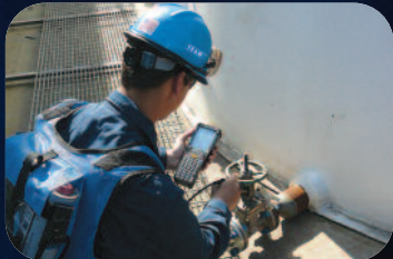
Emissions Control Services