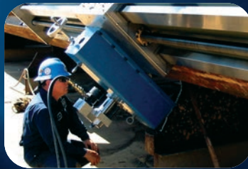
Field Machining Services