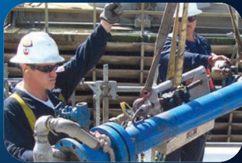
Hot Tap Services