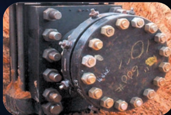
Pipe Repair Services