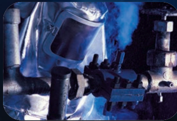
Leak Repair Services