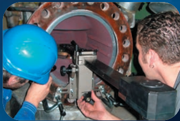
Valve Repair Services

The right people, technology and experience to keep your pipelines and plants online.