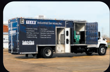
Mobile Heat Treating

800-662-8326 www.teamindustrialservices.com