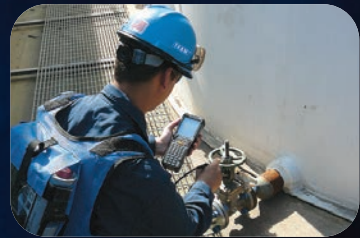
Emissions Control Services